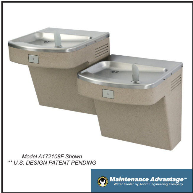
Model A172108F Shown ** U.S. DESIGN PATENT PENDING

Please visit www.murdockmfg.com for most current specifications.